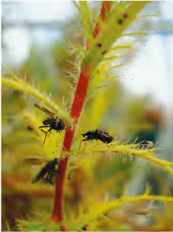
Figure 1: Pameridea on Roridula dentata .

Roridula dentata is a rather more untidy plant (Fig. 3) which branches freely from a young age without the necessity of flowering. The leaves are similar in shape to R. gorgonias but are pinnate, having 7-8 dentations on either side and are to 7.5 cm in length. They are a light apple green color and grow from a bright red soft stem which gradually becomes woody and brown with age (Fig. 3). Unlike R. gorgonias the leaves are produced singly along the stem from an open rosette, but age and die back in the same way, remaining attached for some time before falling from the plant. An interesting observation with this species is the pungent smell it emits during hot weather, best described as a mix of sweet corn and sewer gas!